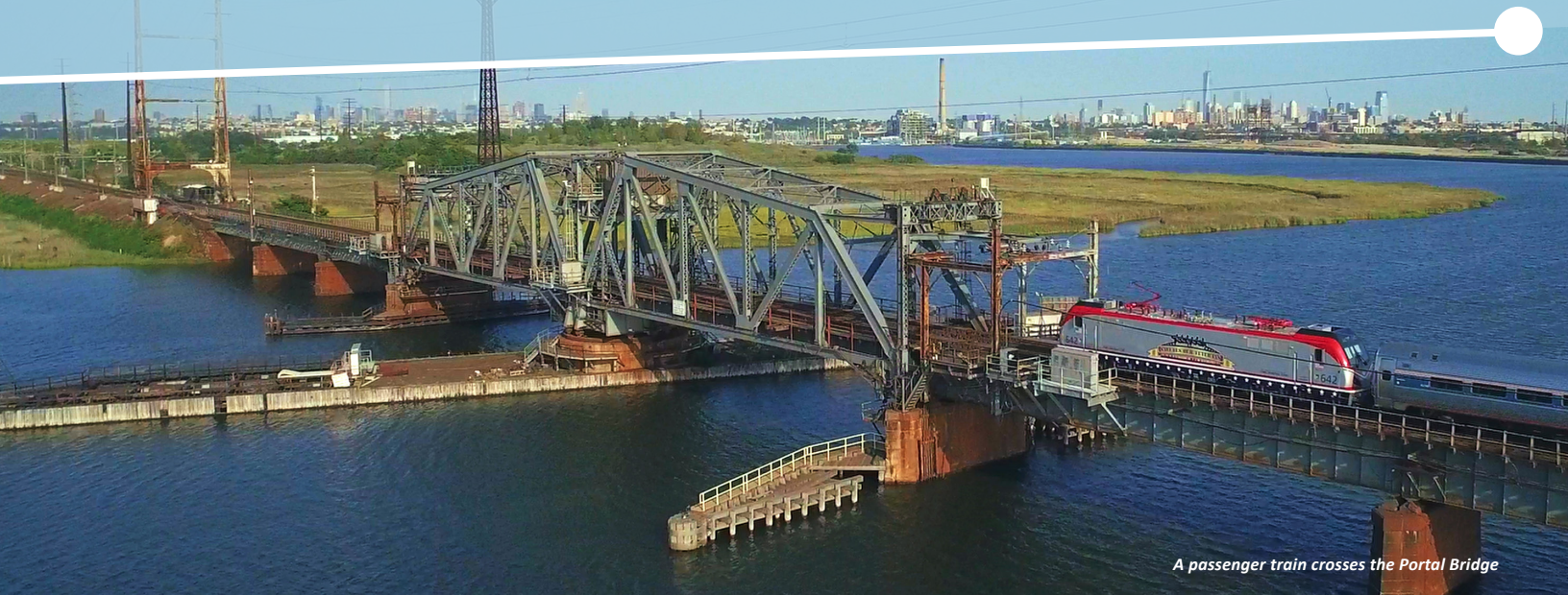
A passenger train crosses the Portal Bridge

Built in 1910, the existing Portal Bridge is a two-track moveable swing-span bridge between the towns of Kearny and Secaucus in Hudson County, New Jersey. A critical Northeast Corridor link for New Jersey commuters and intercity rail customers to New York City, the century-old bridge is in need of replacement.