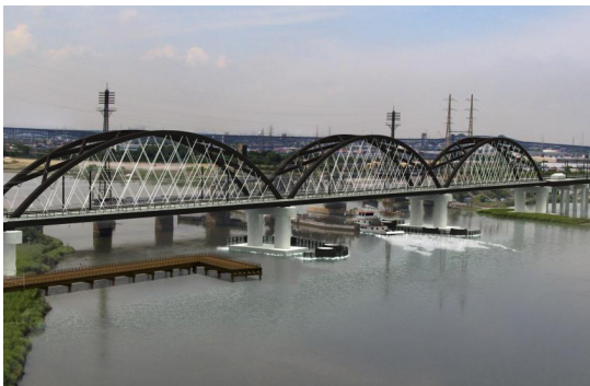
Rendering of future Portal North Bridge.

The Portal North Bridge Project is a key component of Phase I of the Gateway Program, a comprehensive set of strategic rail infrastructure improvements designed to improve current services and create new capacity that will allow the doubling of passenger trains running under the Hudson River.